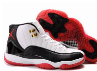
Air Jordan CDP Collezione Countdown Pack 11 / 12 ID:1343 Free Shipping